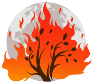
The Burning Bush Ex 3:1-12