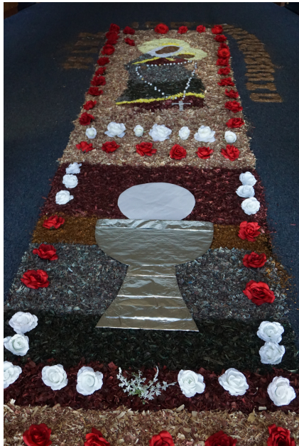
Celebrating the Eucharistic Liturgy at Holy Rosary parish, Jacksonville, FL

The discussion will take place with the author on Tuesday, February 8, 9-10:30 am Eastern Time. Registration is required. Purchase the book through your local book store or visit Penguin Random House .